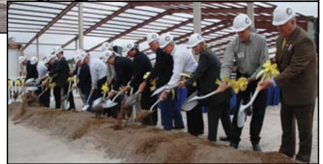
Top: New Multi-Use Facility view from the Western edge. Bottom: Ceremonial Groundbreaking for the new facility.

This year the San Antonio Stock Show & Rodeo has committed $8.1 million to education. The amount represents scholarships, grants, endowments, junior livestock auctions, Calf Scramble program, and show premiums paid to youth in the state of Texas. This brings the total amount that the organization has committed since the inception of